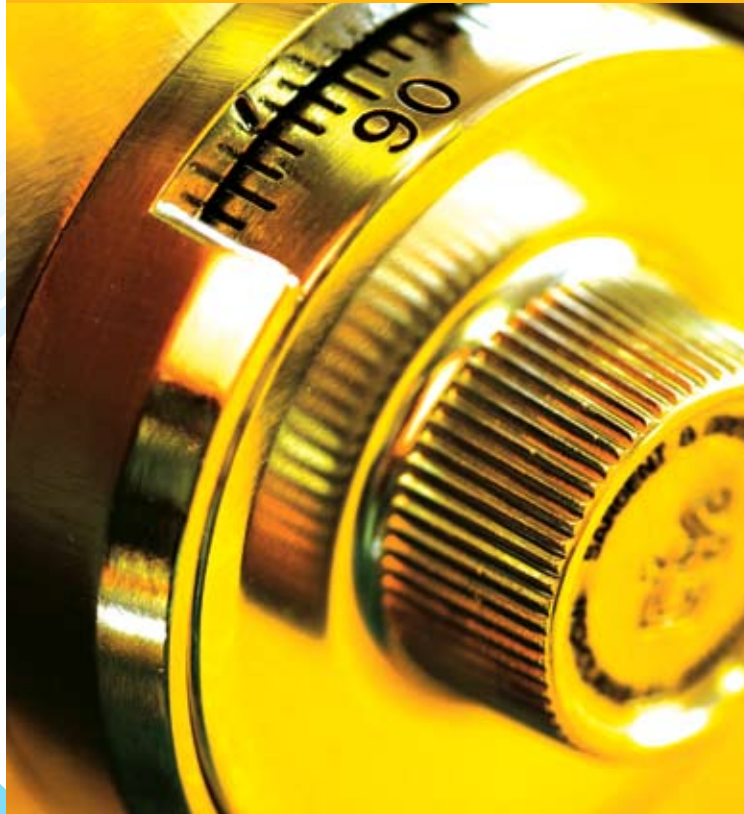
Safes & Vaults

API currently manufactures over 50 different models of Safes, Vaults and Strong Room Doors for use in government, commercial, domestic and industrial environments. Our products meet standards that are approved by leading banks, Federal and State Government departments and all the major insurance companies.