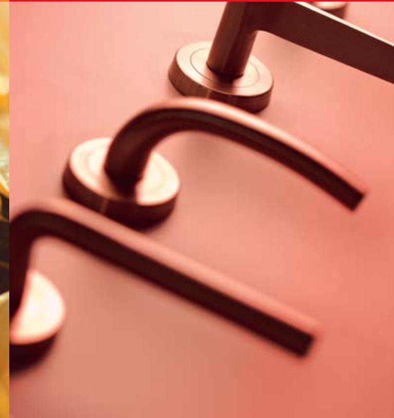
Architectural Hardware Solutions

API works with Australia's leading developers, builders and architects to provide door hardware and fittings for major commercial, private and State facilities all around Australia. Our Service Division can provide a complete install service and lifetime maintenance program.